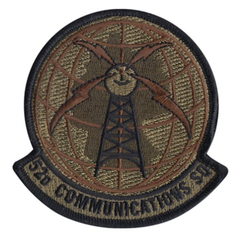
Approved, 30 Sep 1997

The top right segment represents day and the bottom segment is night. The microwave tower with electronic flashes represents the many forms of communications provided the host base. The tower and electronic flashes extend into the night and day segments to show 24-hour operations. The top left segment is a simulated radar screen with five targets symbolizing the unit's air traffic control mission for the five bases under its control. The central star symbolizes NATO and indicates that it touches all phases of the unit mission.